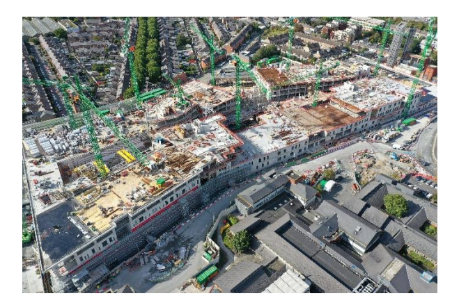
Figure 1Summer 2020 St James's Side of the NCH

BAM expect to be back to full complement of staff (1200) after the New Year subject to co vid restrictions.